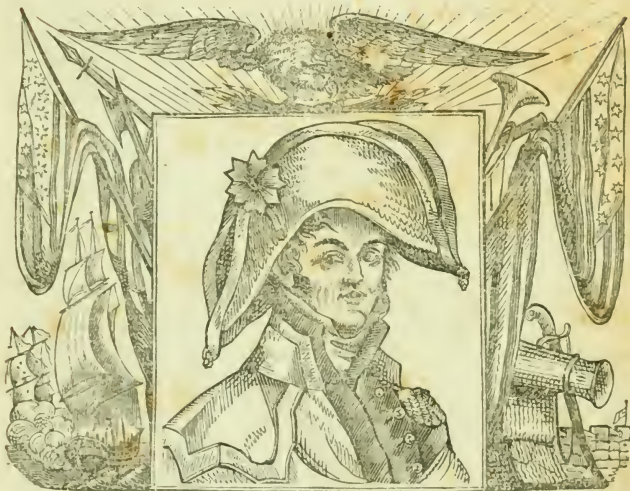
Commodore Porter, the Hero of the Pacific.—Page 213.